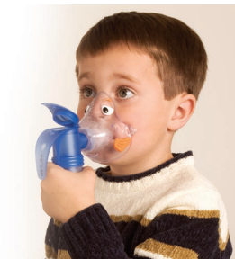
BUBBLES THE FISH II™ PEDIATRIC AEROSOL MASK PART NO. 44F7248