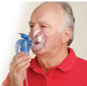
PART NO. 14F20-PVC MASK, ADULT (RIGID) PART NO. 14F20-PP (not shown)