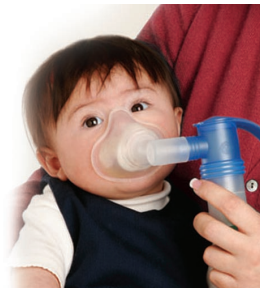
PARI BABY™ CONVERSION KIT SIZE 1, 1-12 MTHS PART #44F2401 SIZE 2, 1-3 YRS PART #44F2402 SIZE 3, 3+ YRS PART #44F3301

Please register your product with PARI at www.PARI.com